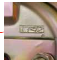
TRP® stamped into service chamber